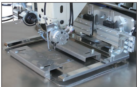
Reliable clamping system