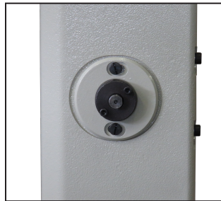
Idler for belt tension adjustment