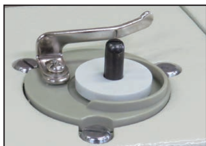
Built-in bobbin winder